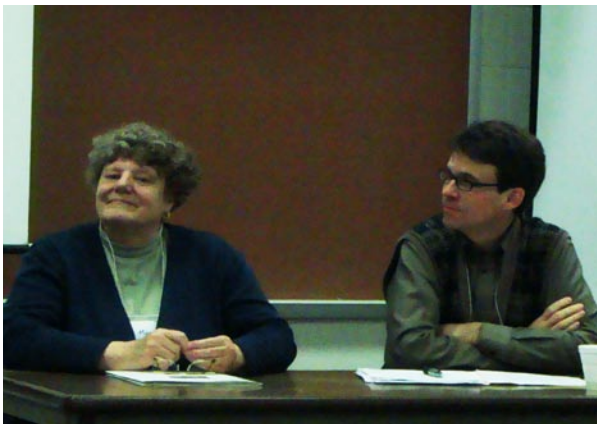
2008 Annual Conference: the late Senator Mary Lundby and Senator Joe Bolkcom, two of Iowa's great river advocates and leaders, participated in a policy panel that addressed river-related legislative issues and ways the public can work with legislators to enact policy that will preserve and protect Iowa's rivers and streams.