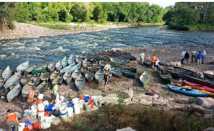
Canoes lined up and ready to leave for the Project AWARE day River Roadshow