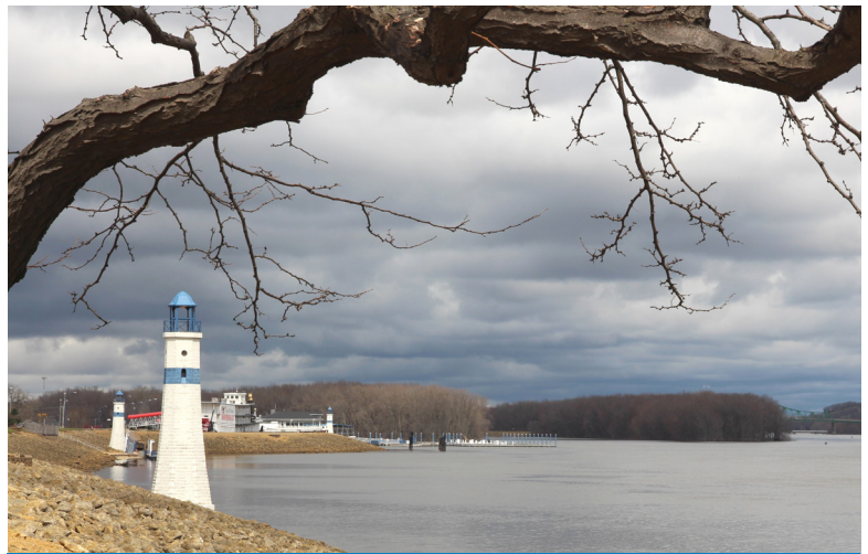
Mississippi River in Clinton, Iowa

“The Mississippi River and all the waters that flow into it are a fantastic natural resource. As we do more to address water quality issues, we increase the value of the resource and makes our communities better places to live. Thanks goes to Clinton officials for their proactive decisions and to Iowa Rivers Revival for recognizing those who are stepping up to do good things.”