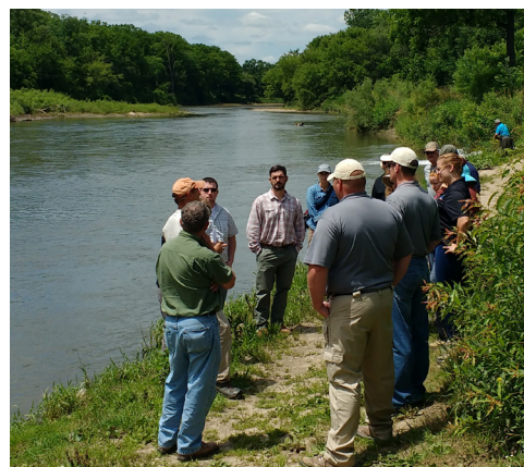
River restoration field day near Elkader