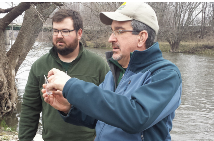
Master River Stewards check the clarity of the river