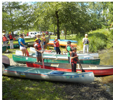
River Rascals learn paddling skills before going out on the water