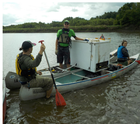
Volunteers with River Rascals pull a freezer out of the river