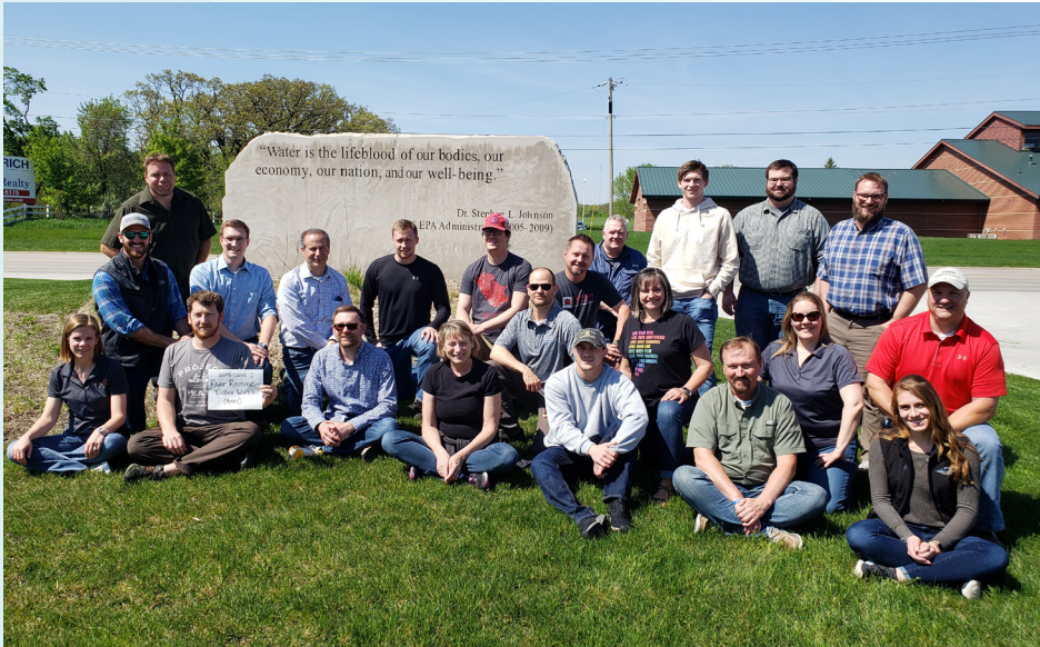
Participants for Level 1 Workshop in Ames, Iowa.

Iowa's River Restoration Toolbox is a two-part series of best management practices developed to assist designers in stream stabilization and restoration projects.