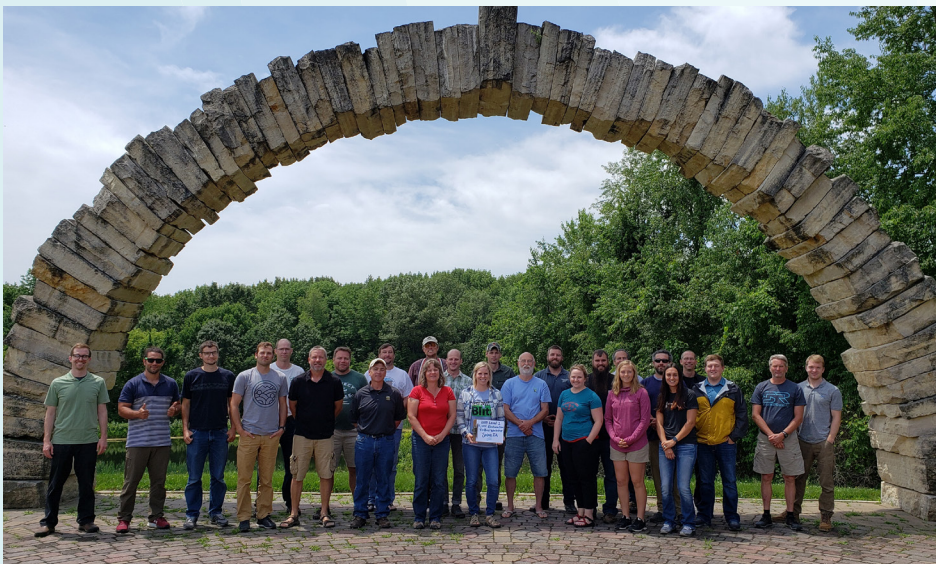
Level 1 workshop participants in Solon, Iowa.

For a full list of trained professionals visit our website at: www.iowarivers.org/river-restoration-graduates .