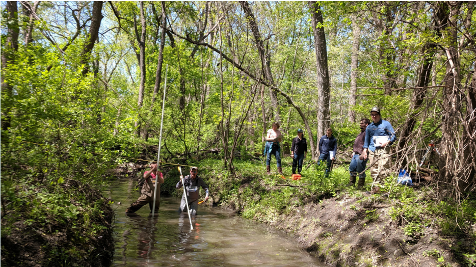
River Restoration Toolbox Participants learning how to survey a stream in Ames, Iowa.